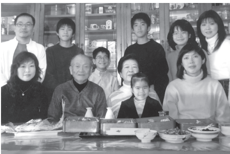
Matsuba Family New Year photo in 2002