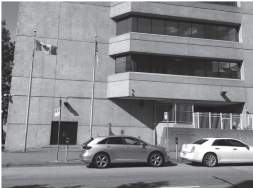
151 East Cordova Street, former location of the Matsuba family business, now occupied by the BC Provincial Court Building