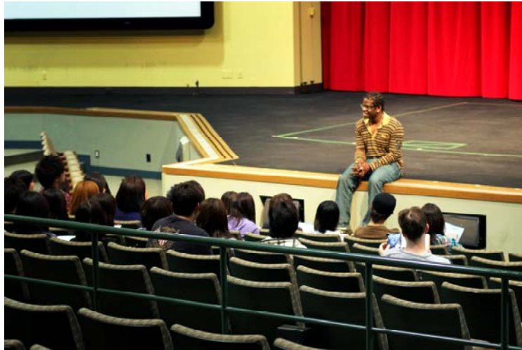
Figure 1: In years when few USJ employees are available for interviews, employee interviews take place in a large group.