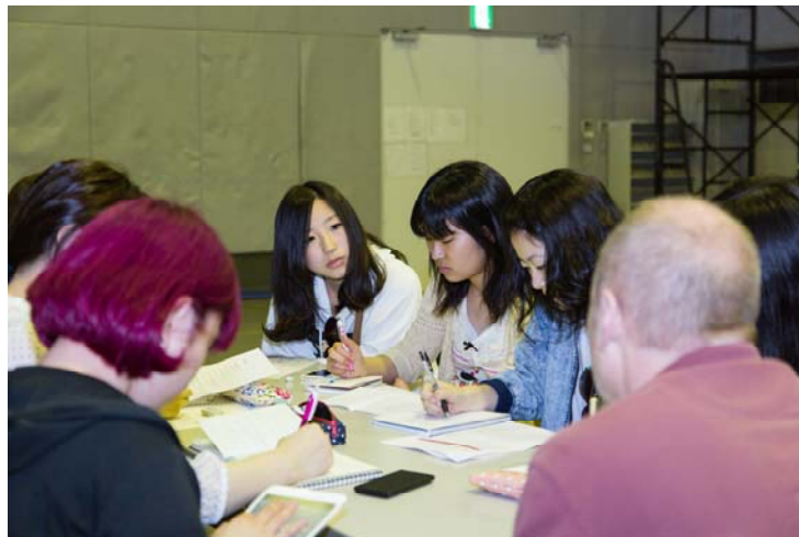
Figure 2: Interviews are conducted in small groups when multiple USJ employees are present.