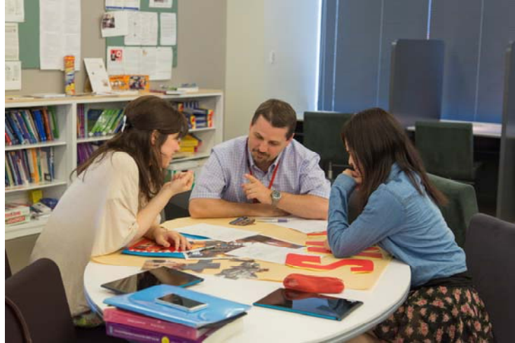
Figure 3: Students consult with their USJ advisor while preparing for the presentation.

On presentation day, advisors compile the total score for each group and give this score to the student's Speaking and Listening teacher to be added to students' final grade.